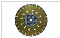
Concrete cutting blade