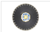
Asphalt cutting blade