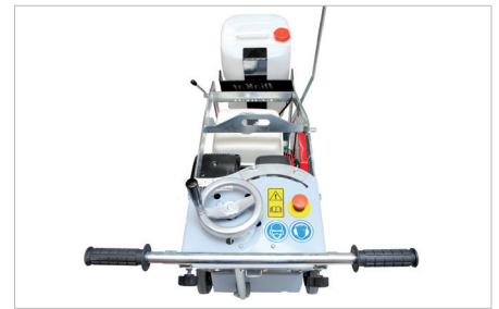
Machine operator view